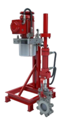
Custom Built Linear Actuators