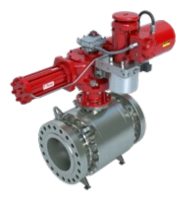
Series 98 EH Actuators