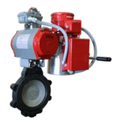
Series 92/93 EH Actuators